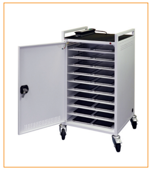
Ideal for storing and charging tablet devices