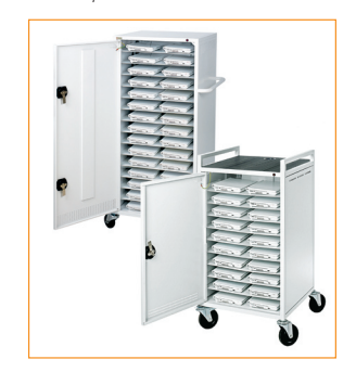
20 and 30 bay models available