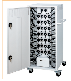
Rear doors provide secure access to the power module, power pack shelves and cables to prevent unauthorised tampering