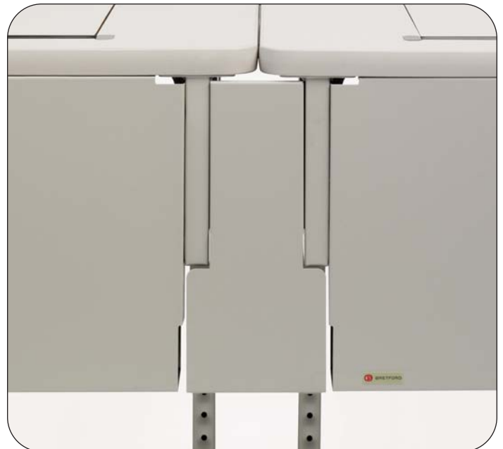
SmartDeck Cord Bin Bridge

35SD21, 35SD21MT, 35SD27, 35SD27MT, 35SD25 & 35SD25MT are height adjustable from 24-32" in 1" increments. The width is 36"w, 66"w or 72"w depending on the model. Table top is constructed from 1" thick 45 lb. density furniture board grade substrate, covered with high pressure .05" (0.1cm) laminate and 3mm TPE T-mold trim. The modesty panel/cord management bin is made from 18-gauge steel and runs the width of the table. Legs are constructed from 18- and 14-gauge steel tubing. The CPU Harness is constructed from steel and mounts on the leg. 36"w model comes with one CPU Harness and the 66"w and 72"w model comes with two. Standard CPU harness adjusts 6"-11-1/2"w and slim CPU harness (MT models) adjusts 3 1/2"-5-7/8"w. All steel parts are constructed with "prime" steel which has a 25% to 35% post-consumer recycled content and are finished in environmentally friendly powder paint. Table shall be GREENGUARD Gold certified. Ship ready to assemble.