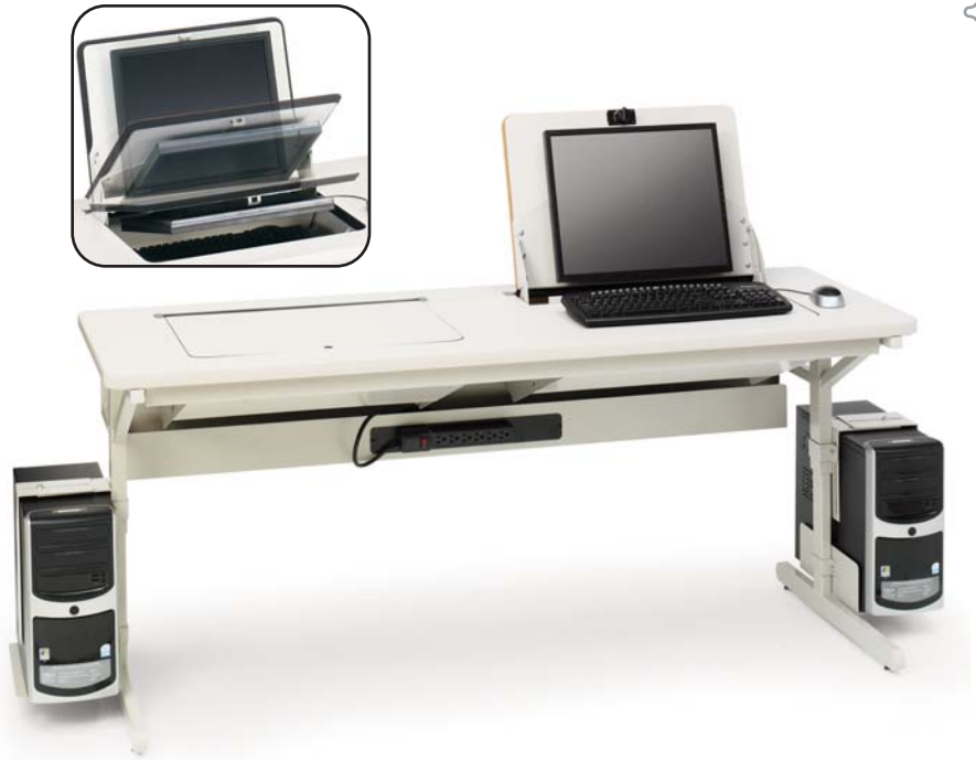
35SD27-GMQ with ECF6 Softwired Electrical Unit