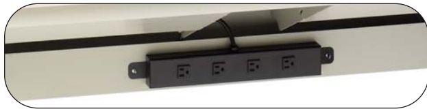
Juice Power System