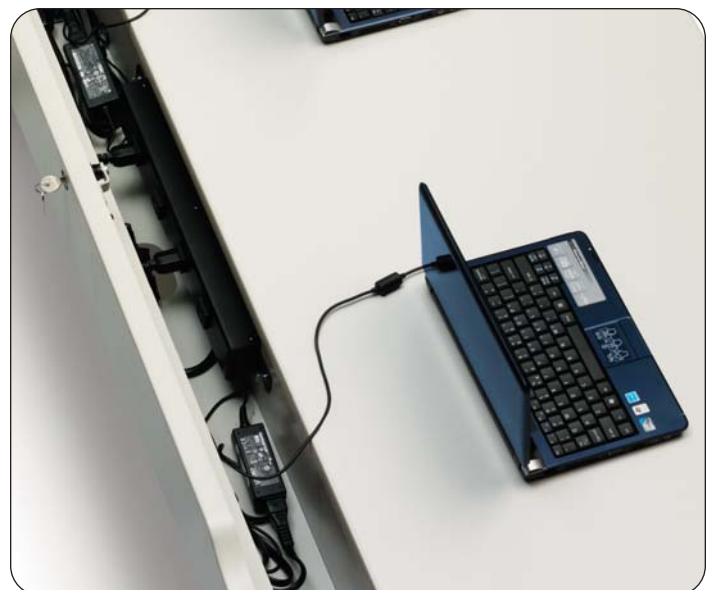
Locking Rear Door For Easy Access And Cord Management