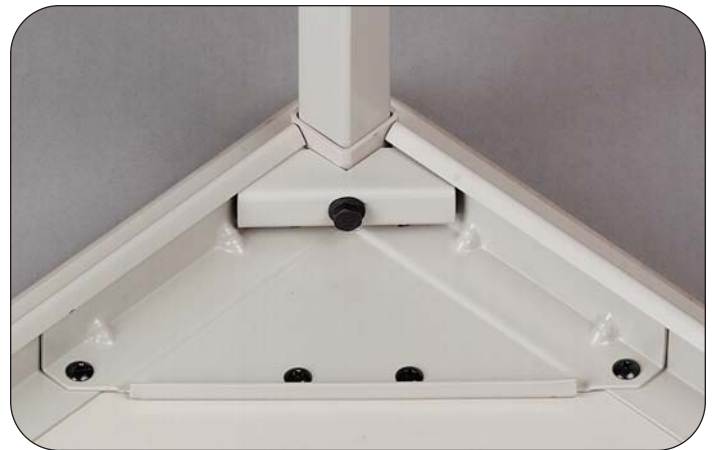
Reinforced Leg Design

Quattro Voltea Computer Tables are height adjustable from 24" to 32" in 1" increments. Available in 24" and 30" depths by 36", 48", 60", 72" and 84" widths depending on the model specified. Laminate table top and cord bin door are made from 1" thick, 45 lb. density particle board and 3mm thick TPE t-molding. The flip up door includes cut-outs to let power and data cables pass into the cord bin and a lock with two keys. Note that all Quattro Voltea tables use the same key to secure the rear flip up door. Table top incorporates a 14-gauge steel apron around the table edge for maximum strength and durability. Telescoping legs are constructed from 1-1/4" 12-gauge steel and 1" 14-gauge steel tubing and attach to the top using a unique hex/tie bolt assembly. Cord management bin runs the width of the table, is constructed of 18-gauge steel and is secured to the table apron and leg with (2) 10-32 screws. Table is available in a Wild Cherry wood grain laminate with Black t-molding and Black powder paint base or with a Grey Mist laminate with Quartz, Cardinal, Polo or Topaz TPE t-molding and a Grey Mist powder paint base. All steel components are constructed with "prime" steel which features 25% to 35% post-consumer recycled content. Table shall be GREENGUARD Gold certified.