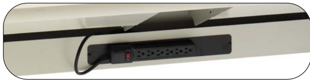
ECF6 Power Strip

ECF6 6-Outlet Power Strip (1 each table)