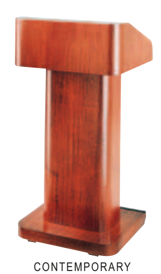
TRADITIONAL MODEL CONTEMPORARY MODEL

Overall: 48"H x 25"W x 24"D Pedestal: 32"H x 201/2"W x 6"D Top Only: 121/2"H x 25"W x 24"D Reading Surface: 24"W x 151/2"D Base Only: 31/2"H x 22"W x 203/8"D Shipping Weight: 115 lb.