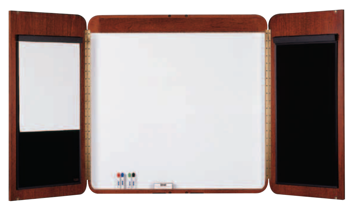
Da-Lite's exclusive Magic Panels are unbeatable for multi-media presentations. Hook-and-loop fabric covers a durable corkboard panel for easy posting of materials.