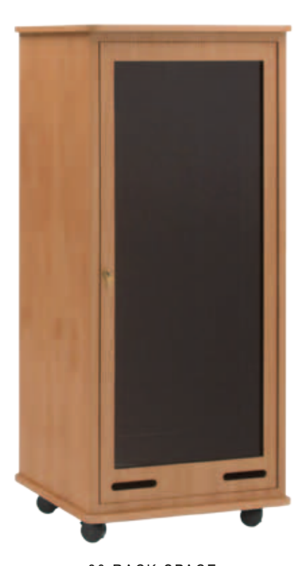
30 RACK SPACE