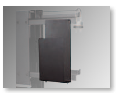
PW-CB Codec Box can be attached to the back of a Video Conferencing Cart monitor mount.