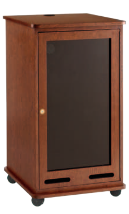
21 RACK SPACE