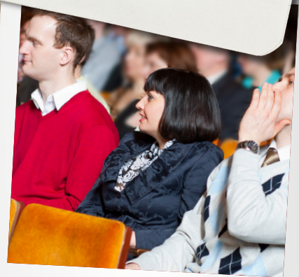
Small Lecture Halls