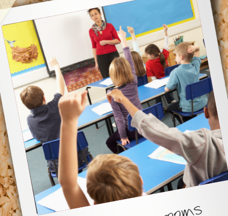
Use in classrooms