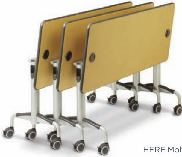
HERE Mobile Tables