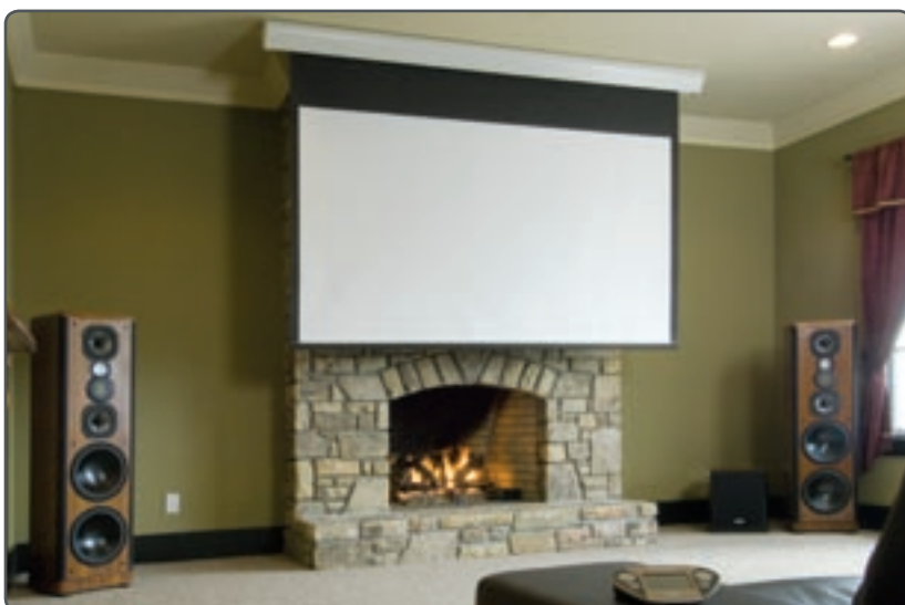
Installer/Dealer/Designer: Harmony Interiors, Asheville, NC Photographer: Scott Arthur Photography, Weaverville, NC