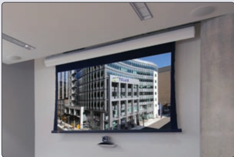
Telus House conference room—Ottawa, Ontario. LEED® Silver Certified.