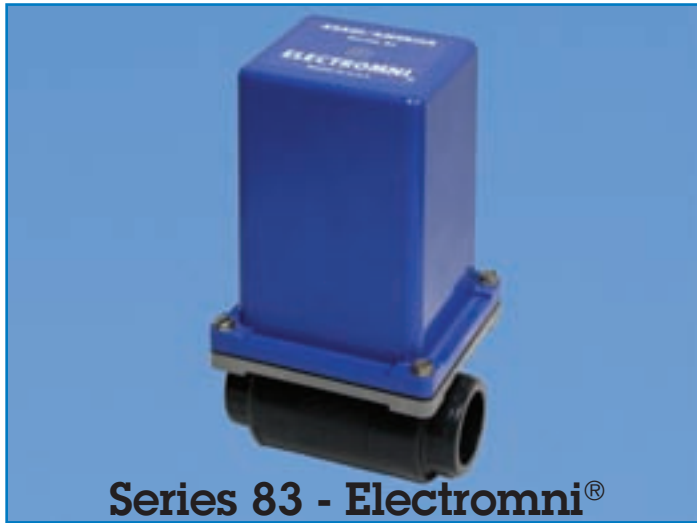
Series 83 - Electromni®