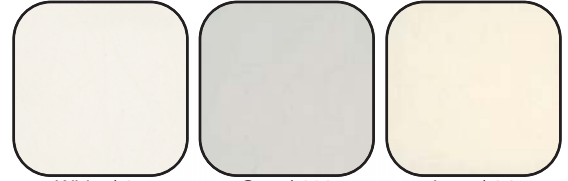
White | 85 Gray | 636 Ivory | 84

Patterns and colors are a representation and may not accurately reflect the final product. Please obtain a sample of the product before making a final selection at www.FRPSamples.com