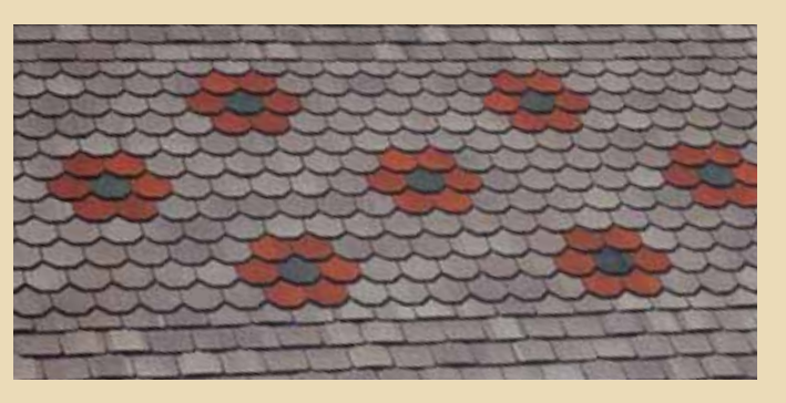
12 courses of Carriage House were incorporated into this Grand Manor roof. The same color (Stonegate Gray) was used for both, with small florette designs created using Carriage House in Georgian Brick and Sherwood Forest.