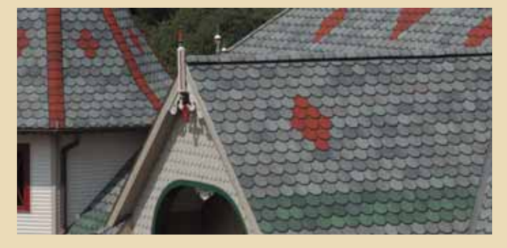
Carriage House in Colonial Slate with caps and diamond accents in Georgian Brick and three courses in Sherwood Forest.