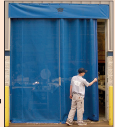
Manual Slide Bug Blocking Curtain Door

For sized other than shown above, please contact dealer. 12"/sec, 36"/sec and Chainhoist available -- please contact dealer. Outside Stand-Off Mounting available for Motorized or Spring Assist doors -- please contact dealer for pricing.