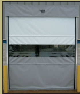
Motorized & Spring Assist Vinyl Roll Up Door

Clear window allows light into work areas. Portable optional wireless door controls attach to forklift for operator control and to control roll-up doors from multiple locations. Helps reduce noise from adjacent areas. Controls airborne contaminant's. Separates inside work areas. Discourages intruders. Constructed using Flame retardant materials including 18 oz. reinforced upper and lower sections (meets NFPA-701) and a 40 mil PVC clear center windowed section (Meets CA. Fire Marshal Retardancy Test). All seams are double lock stitched using mildew/rot resistant thread -- all edges are completely finished. Maintain toggle switch control included on Motorized door. Header mounting included on all doors. Available in Gray, Black, Blue, Green, Red, Yellow or White -- please specify when ordering. All vinyl (no window) is optional -- please specify when ordering. Not a recommended door where wind load or pressure differential exists. See Drawtite Doors for those applications. FOB Shipping Point.