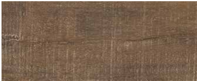
X-Grain Khaki L6602

50-Year Residential / 10-Year Commercial Warranty