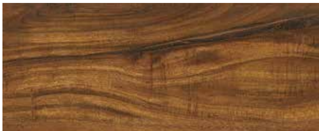
Acacia Natural L0242††