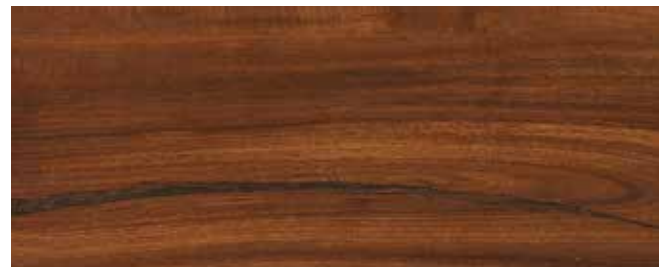
Acacia Cayenne L0243*†