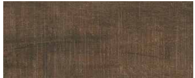
X-Grain Sable L6603