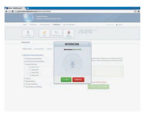
Intercom User Interface