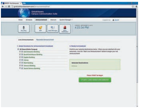
Broadcast PA Announcements