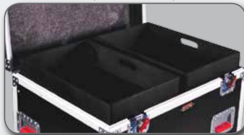
Plywood Lift Out Trays