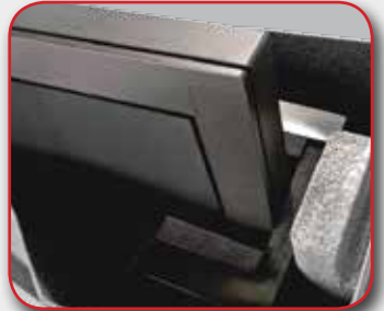
Single LCD Interior

Check out the video of this product on our website