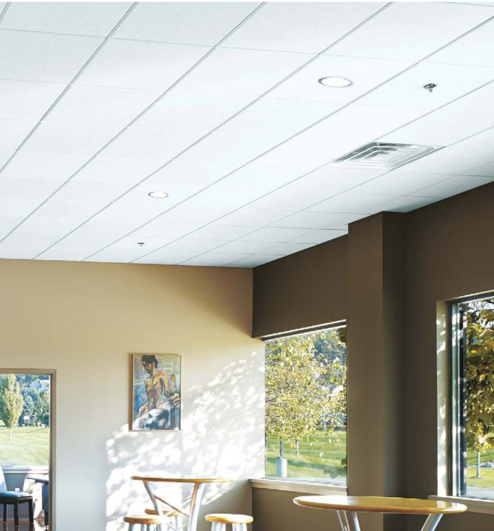
Calla™ Beveled Tegular ceiling panels with Interlude® 9/16" suspension system in Blizzard White TC Motion, Lancaster, PA