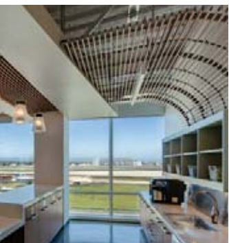
4-5 One Source