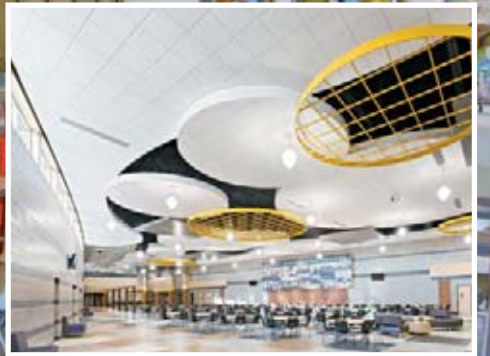
Formations™ Curves and Squares; Fine Fissured™