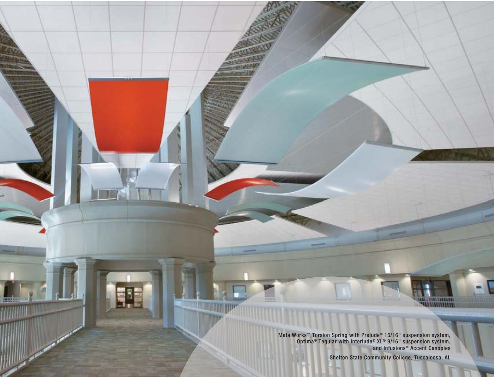
MetalWorks™ Torsion Spring with Prelude® 15/16" suspension system, Optima® Tegular with Interlude® XL® 9/16" suspension system, and Infusions® Accent Canopies Shelton State Community College, Tuscaloosa, AL