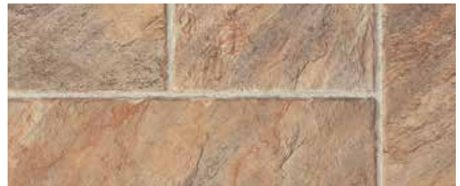
Puesta del Sol L6543