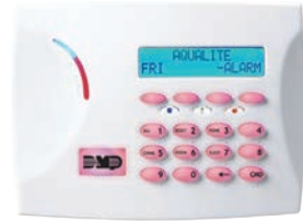
Red Backlighting for Alarm Conditions

In a normal state, both the keypad and logo backlighting remain Blue on Aqualite keypads or Green on Thinline keypads. However, during an alarm state, the keypad and logo turn Red. The change in color allows persons on-site to instantly recognize an alarm condition.