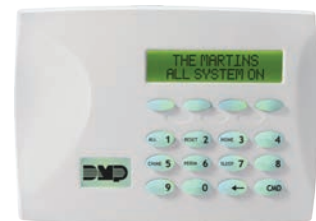
9000 Wireless Keypad

The 9060 and 9063 Wireless Keypads are supervised keypads that provide installation flexibility. These full-feature keypads include four 2-button panic keys and an internal sounder. The backlit keypad is easy to read, and both the keypad and logo turn Red in alarm conditions, providing a visual alert. Both Keypads have a 32-character liquid crystal display, and can be programmed with a 16-character home or business name. The 9063 keypad also includes a built-in proximity reader for codeless arming and disarming.