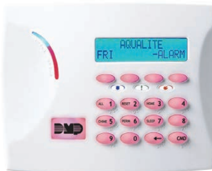
Red Backlighting for Alarm Conditions

In a normal state, both the keypad and logo backlighting remain Blue. However, during an alarm state, the keypad and logo turn Red. The change in color allows persons on-site to instantly recognize an alarm condition.