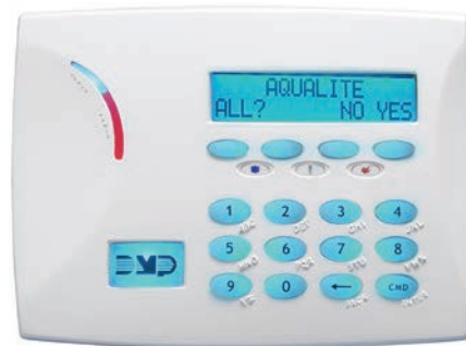
Blue Backlighting for Normal State