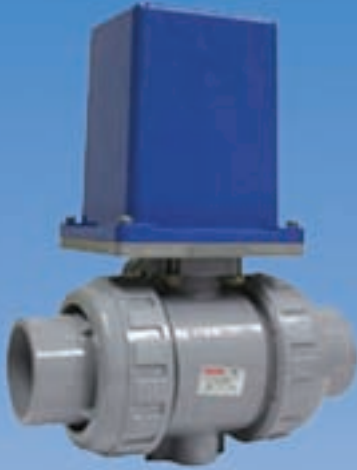
Series 83/Type-21 Ball Valve