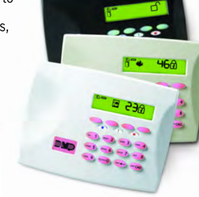
Thinline™ Series Icon Keypads available in white, ivory, and black.

save time and phone calls The exclusive cancel/verify feature prompts you to cancel or verify (confirm) an alarm right at the keypad. This saves you time in having to call the monitoring station to cancel the alarm, or wait for their call. The cancel/verify feature also allows you to turn off the audible