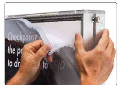
Easily interchangeable graphic panels