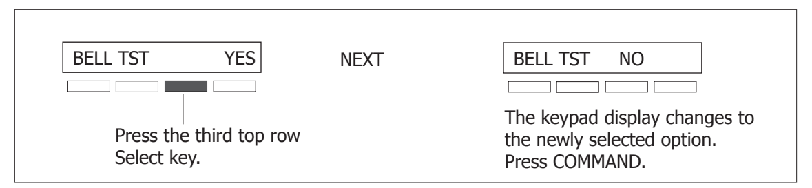
Figure 3: Changing the Currently Selected Option

For example, if the current prompt is selected as YES and you want to change it to NO , press the third top row Select key from the left. The display changes to NO . Press the COMMAND key to go to the next prompt. See Figure 3.