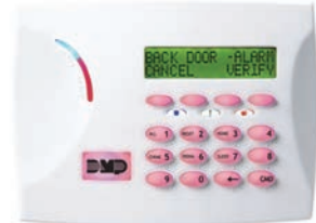
Red Backlighting for Alarm Conditions

In a normal state, both the keypad and logo backlighting remain Blue on Aqualite keypads or Green on Thinline keypads. However, during an alarm state, the keypad and logo turn Red. The change in color allows persons on-site to instantly recognize an alarm condition.