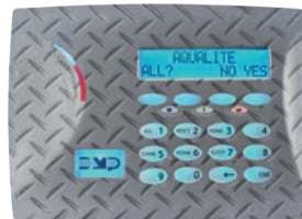
Aqualite/Thinline Keypad (Designer Series Cover)

The stylish and sleek 7000 Series keypads provide three 2-button Panic keys, AC power and Armed LEDs, 32-character display, backlit logo and keyboard plus an internal sounder. The 7063 keypad also includes a built-in proximity reader for codeless arming and disarming.