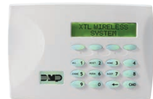
9000 Wireless Keypad

The 9060 and 9063 Wireless Keypads are supervised keypads that provide installation flexibility. These full-feature keypads include four 2-button panic keys and an internal sounder. The backlit keypad is easy to read, and both the keypad and logo turn Red in alarm conditions, providing a visual alert. Both Keypads have a 32-character display, and can be programmed with a 16-character home or business name. The 9063 keypad also includes a built-in proximity reader for codeless arming and disarming.