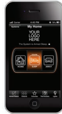
Supports iOS™ & Android™ Devices