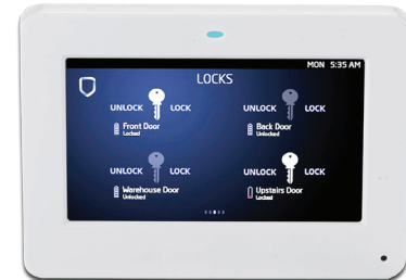
White Gloss Finish