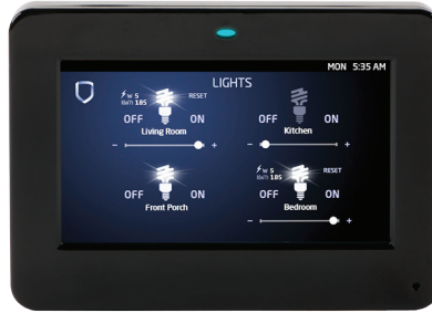
Z-Wave Lights Screen

Z-Wave devices that are plugged into Smart Switches can be connected to the panel to provide a meter reading on the keypad. Both instantaneous and accumulative readings are provided.