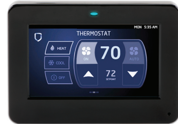
Black Gloss Finish

Two wired versions and one wireless version of the graphic touchscreen keypad are available in black or white.