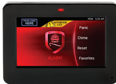
Red Graphics screen during alarm

During an alarm state, the shield on main screen turns Red. The change in color allows the user to instantly recognize an alarm condition, even if the siren has silenced. The shield remains red until reset by the user.