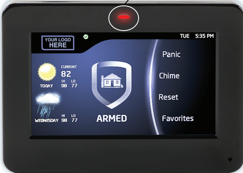
Network Connected Panel Display