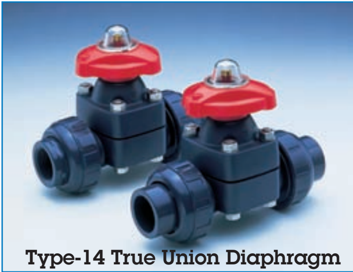
Type-14 True Union Diaphragm