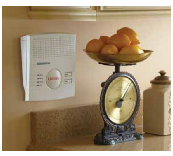
The PERS-2400B base unit can also be wall mounted