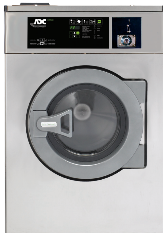
EWS-30 COIN Washer/Extractor