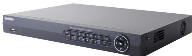
Front Panel with Buttons