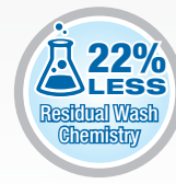
SUPERIOR RINSE RESULTS