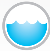
NORMAL BATH RINSE