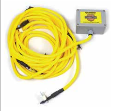
Copper Cop cable harness & interconnect box