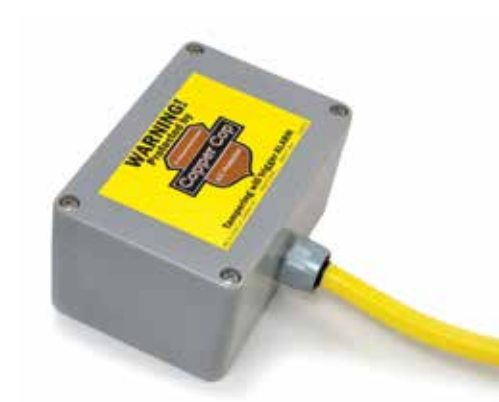
Copper Cop tamper-resistant alarm interconnect box

Linear's Copper Cop consists of a unique 30-foot cable harness with eight self-tapping screw-in clip assemblies, connected to a weatherproof alarm interconnect box. The system is ready to accept a wireless alarm transmitter or hard-wired connection to a security alarm panel. Once Copper Cop is installed on the exterior of the HVAC unit and activated, removal of the HVAC unit cover or tampering with the cable triggers an alarm.