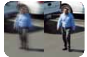
Electronic Image Stabilization