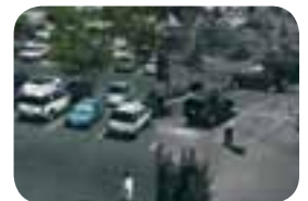
Day or Night Operation