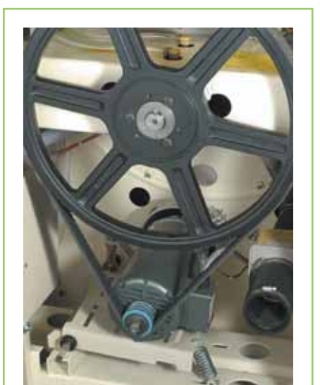
Simple, streamlined design.

Shell and washing cylinder are made of stainless steel to resist corrosion. Base and shell back have two coats of durable epoxy paint baked on. Epoxy coating provides a long lasting, impervious finish. (Warm grey color is standard, almond and white colors are optional.)