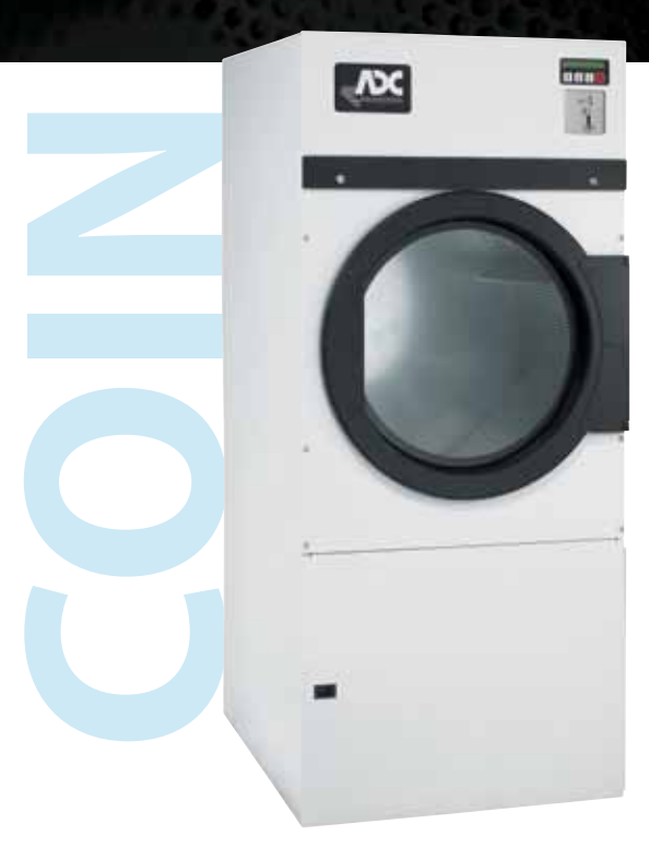
AD-24 Coin Dryer