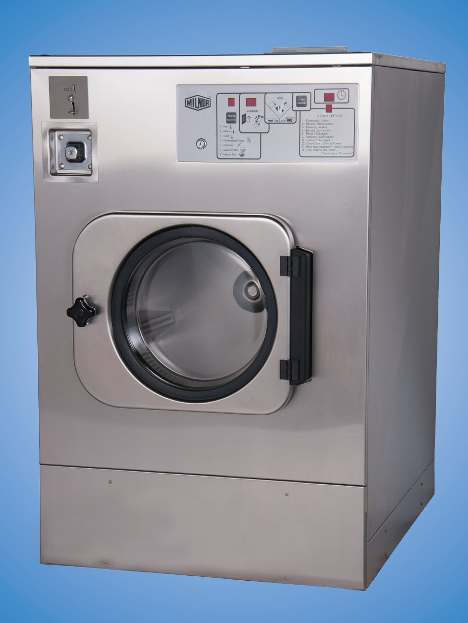
45 lb. capacity model MCR18E4

QUALITY, VALUE, DURABILITY - FOUR CAPACITIES - EASY-TO-USE CONTROLS