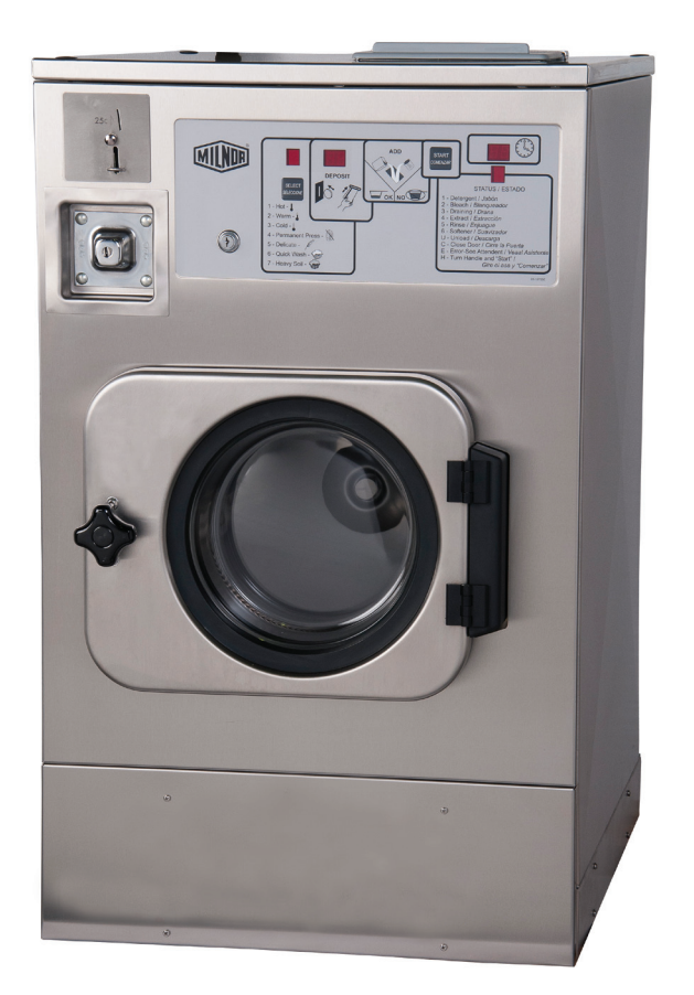
20-25 lb. capacity model MCR12E5

Pellerin Milnor Corporation P.O. Box 400, Kenner, LA 70063 USA Phone: (504) 712-7656 Toll Free: (800) 469-8780 Fax: (504) 468-3094 www.milnorcoin.com milnorinfo@milnor.com