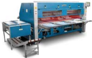
Skyline SP Series

If multi-bar storage in each lane is not required, consult a Chicago professional for information about Aircumulator Solo —the Chicago single bar accumulator system. If the flexibility to fold and stack small pieces, as well as stack only unfolded small pieces is required, the Skyline SP folding/stacking series should be considered. Consult Chicago Skyline brochure #7524 or Skyline SP brochure #7525 for details. Aircumulator may also be built into a new Chicago Skyline large piece folder as original equipment if the flexibility to fold large and small pieces, as well as the ability to stack small pieces is required.