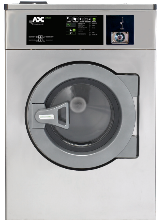
EWS-60 COIN Washer/Extractor