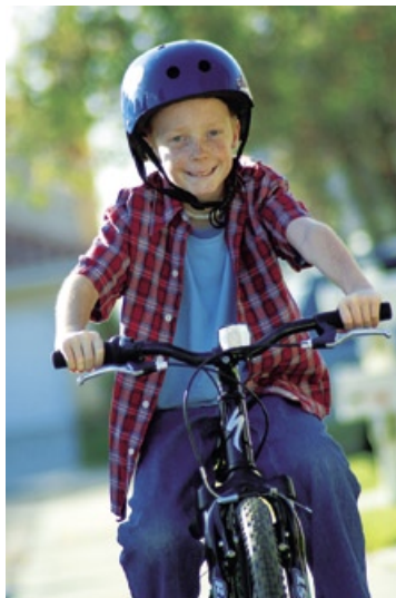
300mm (Equivalent to 465mm) Exposure: Aperture Fully Opened Auto ISO400