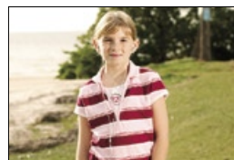
70mm (Equivalent to 109mm)