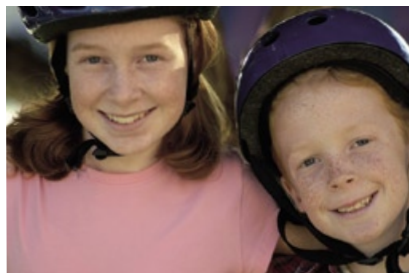
70mm (Equivalent to 109mm) Exposure: Aperture Fully Opened Auto ISO400

* Multi-layer coatings on cemented surfaces of plural elements