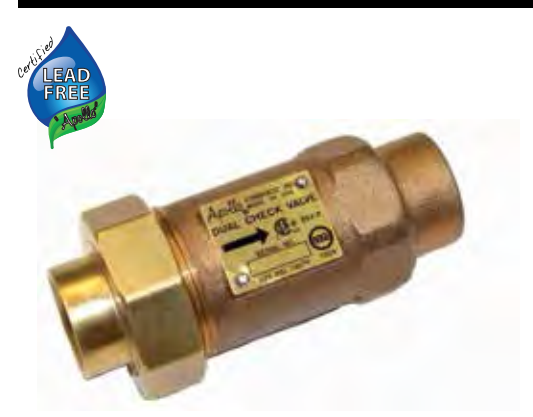
Dimensions (In.) - Weight (Lbs.)