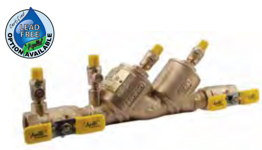
Sizes 1/2", 3/4", 1", 1-1/4", 1-1/2", 2"