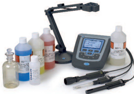
Lab LDO/pH/Conductivity Kit, Prod. No. 8508700