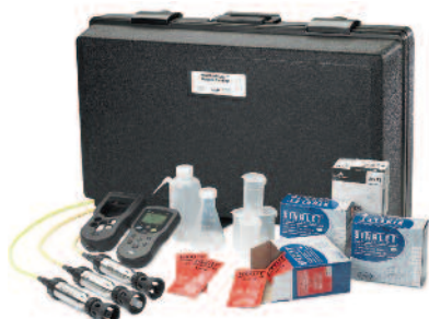
Rugged LDO/pH/Conductivity Field Kit, Prod. No. 8505300