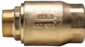
61-200 Male x Female Threaded 1/4" through 2"