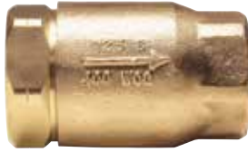
61-100 Female x Female Threaded 1/4" through 3"