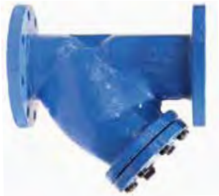
(Optional Epoxy Coating Shown)