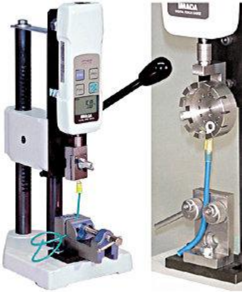
Setup shows WG-2 grip and GT-30 vise chuck