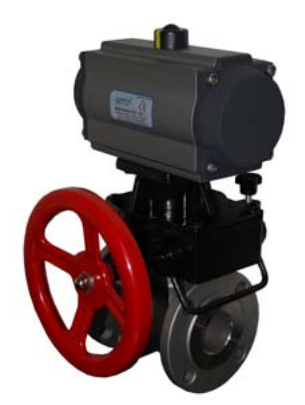
aero2 Actuator Declutchable Manual Override B41Rev3 Valve