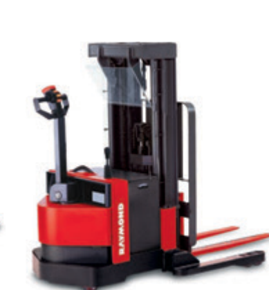
RSS 22/30/40 WALKIE STRADDLE + Short travel distances with need to stack 2-4 levels high + Small aisle requirement + Ideal for smaller storage areas + Pallet storage and retrieval + Load Capacity lbs. (kg): 2200, 3000, 4000 (998, 1361, 1814)