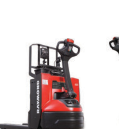
8210 WALKIE PALLET TRUCK + Short walking distance + Light duty cycles + Retail store, wholesale delivery and food processing applications + Navigating in tight spaces + Load Capacity lbs. (kg): 4500 (2041)