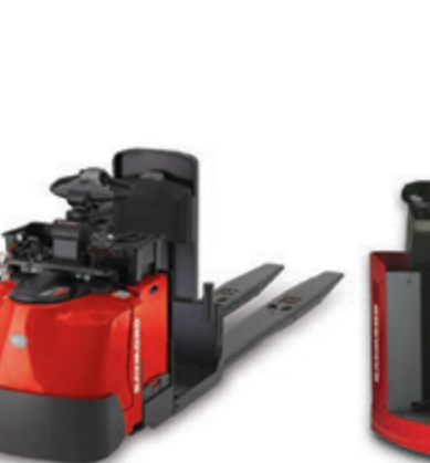
8510 CENTER RIDER PALLET TRUCK + Longer travel distances + Heavy duty cycles + Handle multiple pallets per trip + Horizontal transport and order picking + Load Capacity lbs. (kg): 6000, 8000 (2722, 3629)