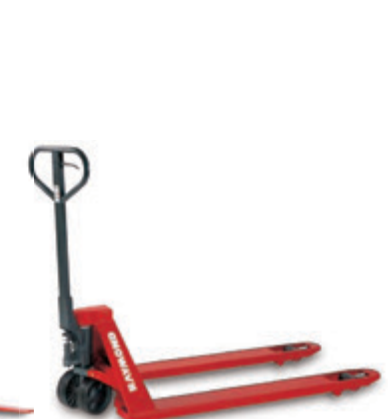
RJ50 HAND PALLET TRUCK + Light weight loads + Intermittent duty cycles + On delivery trucks + Dock work + Special application models available + Load Capacity lbs. (kg): 5500 (2495)