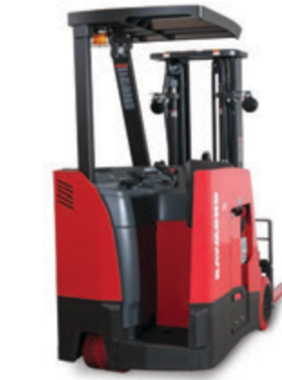
4150 STAND-UP COUNTERBALANCED + Frequent on/off + Loading/unloading trailers and containers + Cross-dock applications + Dock work + Load Capacity lbs. (kg): 3000, 3500, 4000 (1361, 1588, 1814)