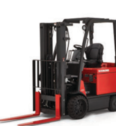
4750 4-WHEEL SIT-DOWN COUNTERBALANCED + Long runs + Infrequent on/off + Attachments + Dock-to-stock/staging + Load Capacity lbs. (kg): 4000, 5000, 6000 (1814, 2268, 2722)