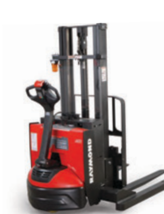
6210 WALKIE STRADDLE TRUCK + Retail store, dock to stock and light duty applications + Maximize vertical storage + Maneuverability in tight, congested spaces + Load/unload trailers + Minimal maintenance + Load Capacity lbs. (kg): 2000 – 2500 (907, 1134)