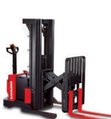
RRS 30 WALKIE REACH + Short travel distances with need to stack 2-4 levels high + Small aisle requirement + Variety of pallet widths + Pallet storage and retrieval + Load Capacity lbs. (kg): 3000 (1361)