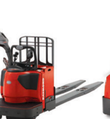
8410 END RIDER PALLET TRUCK + Longer travel distances + Heavy duty cycles + Handle multiple pallets per trip + Dock, horizontal transport and order picking + Load Capacity lbs. (kg): 6000, 8000 (2722, 3629)