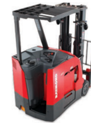
4250 STAND-UP COUNTERBALANCED + Frequent on/off + Loading/unloading trailers and containers + Dock-to-stock transport + Attachments + Load Capacity lbs. (kg): 3000, 3500, 4000, 5000 (1361, 1588, 1814, 2268)