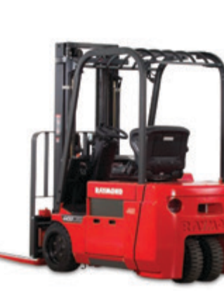
4450 3-WHEEL SIT-DOWN COUNTERBALANCED + Long runs + Infrequent on/off + Loading/unloading trailers + Dock-to-stock/staging + Load Capacity lbs. (kg): 3000, 3500, 4000 (1361, 1588, 1814)