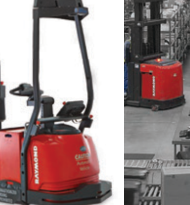
3010 RAYMOND COURIER® AUTOMATED PALLET TRUCK + Longer, repeatable horizontal transport tasks + Heavy duty cycles + Handle multiple pallets per trip + Load Capacity: 8000 lbs. (3629) + Distribution applications including: + Put-away-dock to aisle + Long hauls + Cross-docking + Staging loads for shipping