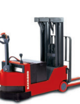
RCS 20/30/40 WALKIE COUNTERBALANCED + Short travel distances with need to stack 2-4 levels high + Wider aisle available + Ideal for smaller storage areas + Pallet storage and retrieval + Load Capacity lbs. (kg): 2000, 3000, 4000 (907, 1361, 1814)