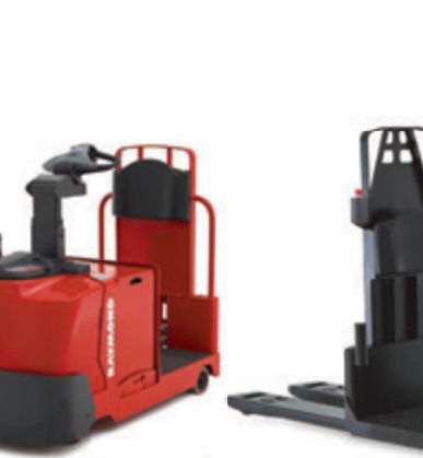
8610 TOW TRACTOR + Longer travel distances + Heavy duty cycles + Applications that pull carts + Horizontal transport and order picking + Load Capacity lbs. (kg): 10000, 230-450 draw bar rating (4536 104-204 draw bar rating)