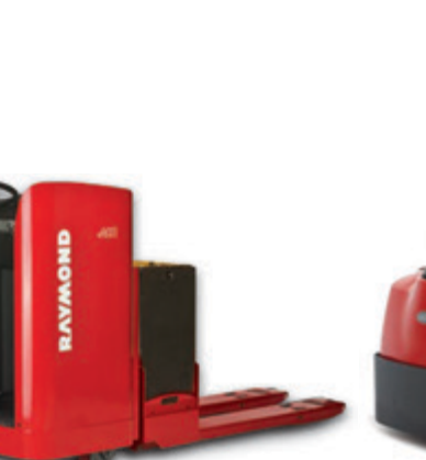
8900 RIDER PALLET TRUCK + Longer travel distances + Heavy duty cycles + Dock, horizontal transport and order picking + Load Capacity lbs. (kg): 6000, 8000 (2722, 3629)