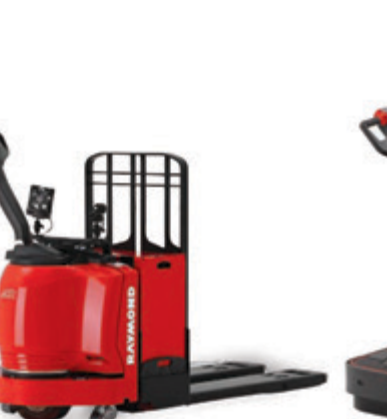
8310 WALKIE PALLET TRUCK + Short walking distance + Heavy duty cycles + Dock work + Limited horizontal transport and order picking + Load Capacity lbs. (kg): 6000, 8000 (2722, 3629)