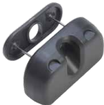
Single Rod Hang Tag