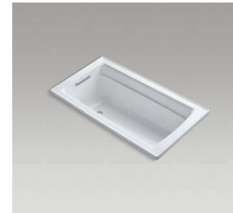
Archer® VibrAcoustic Bath 60" x 30" x 19" K-1947-VB/-VBL/-VBR K-1947-VBLA/-VBRA 60" x 32" x 19" K-1122-VB K-1122-VBLA/-VBRA 66" x 32" x 19" K-1949-VB K-1949-VBLA/-VBRA 72" x 36" x 19" K-1124-VB K-1124-VBLA/-VBRA