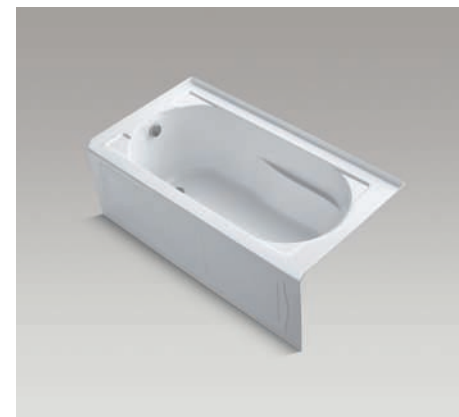
Devonshire® VibrAcoustic Bath 60" x 32" x 20" K-1357-VB K-1357-VBLA/-VBRA