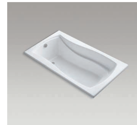
Mariposa® VibrAcoustic Bath 60" x 36" x 20" K-1239-VB/-VBL/-VBR K-1239-VBLA/-VBRA 66" x 36" x 20" K-1224-VB/-VBL/-VBR K-1224-VBLA/-VBRA 72" x 36" x 20" K-1257-VB/-VBL/-VBR K-1257-VBLA/-VBRA