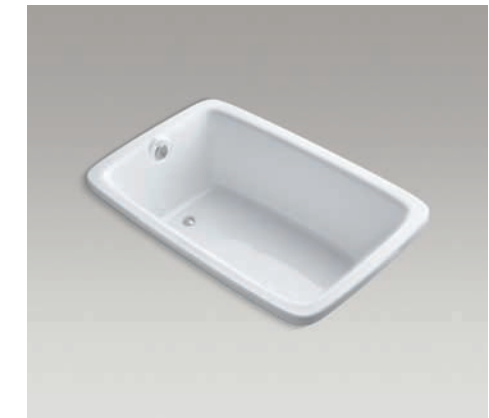
Bancroft® VibrAcoustic Bath 60" x 32" x 20" K-1151-VBLA/-VBRA 66" x 42" x 22" K-1158-VB