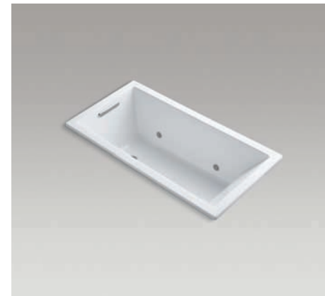
Underscore® VibrAcoustic Bath 60" x 30" x 19" K-1167-VB/-LVB/-RVB K-1167-VBC/-LVBC/-RVBC 60" x 32" x 21" K-1168-VB/-VBC 60" x 36" x 21" K-1849-VB/-VBC 66" x 32" x 22" K-1822-VB/-VBC 66" x 36" x 22" K-1173-VB/-VBC 72" x 36" x 23" K-1835-VB/-VBC 72" x 42" x 23" K-1174-VB/-VBC 48" x 48" x 34" K-1969-VB/-VBC