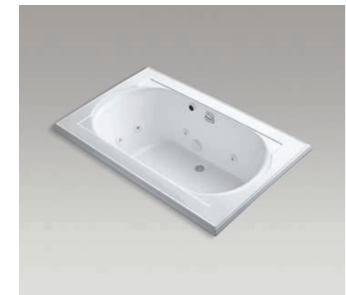
Memoirs® VibrAcoustic Bath 66" x 42" x 22" K-1170-VB 72" x 42" x 22" K-1418-VB