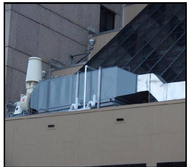
12,000 cfm K-Pack Rooftop Installation